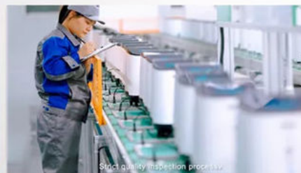
Strict quality inspection process