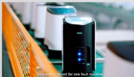
One quality report for one fault machine