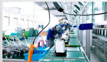
Stable and reliable inequality