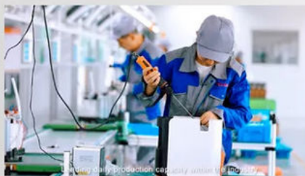
Large daily production capacity assist the global market

Based on our full experience over 20 years on both welding and stitching technicals, we have passed the certification of ISO9001, possess the Audit report of SA8000, Sedex, L'Oreal, LVMH, and we are always growing up together w/ too many big brands.