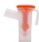
9 Atomizing cup