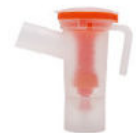
9 Atomizing cup