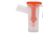
9 Atomizing cup