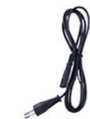
2 Power cord