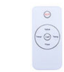
3 Remote control