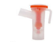
9 Atomizing cup