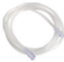
11 Atomizing tube