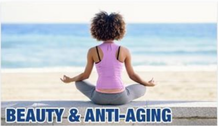
BEAUTY & ANTI-AGING

Hyperbaric Oxygen Therapy is more and more favored by famous athletes all over the world, and they are also a necessary for some sports gyms for helping people recovery faster from hard training.