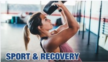
SPORT & RECOVERY

Hyperbaric Oxygen Therapy is more and more favored by famous athletes all over the world, and they are also a necessary for some sports gyms for helping people recovery faster from hard training.