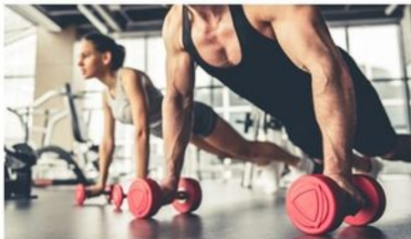
Sport & Recovery