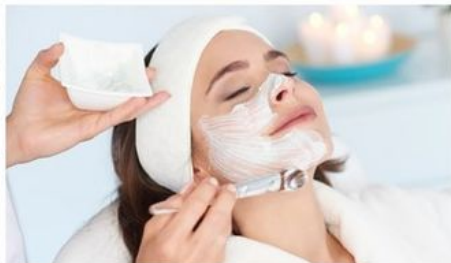
Beauty & Anti-Aging