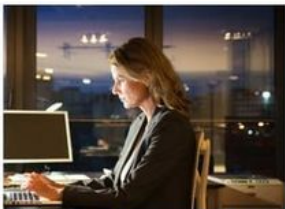
Working overtime and staying up late