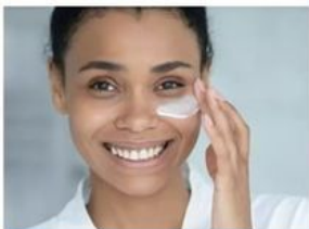
Beauty-loving skincare crowd