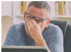
Body easily fatigued