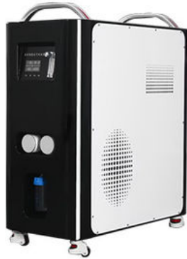
New hyperbaric oxygen equipment