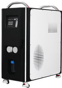
New hyperbaric oxygen equipment

Our Hyperbaric Oxygen Chamber product comes with comprehensive technical support and services to ensure that you have a hassle-free experience. Our team of experts is available to answer any questions you may have about the product and its usage. We offer installation and training services to ensure that the product is set up correctly and that you are familiar with all of its features. In addition, we provide maintenance and repair services to keep your Hyperbaric Oxygen Chamber in top condition. Our goal is to provide you with the best possible experience with our product, and we are committed to ensuring that you are completely satisfied with your purchase.