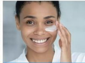
Beauty-loving skincare crowd