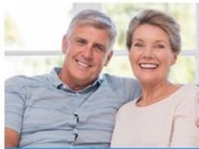
Middle-aged and elderly