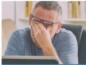
Body easily fatigued