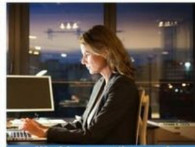
Working overtime and staying up late