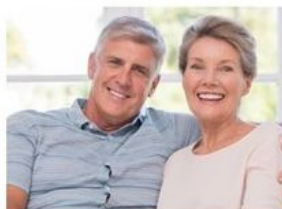
Middle-aged and elderly