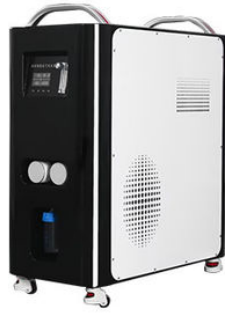
New hyperbaric oxygen equipment

Overturn the complexity of traditional household