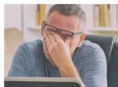
Body easily fatigued