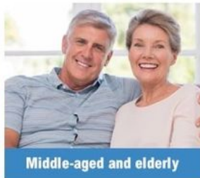
Middle-aged and elderly