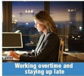
Working overtime and staying up late