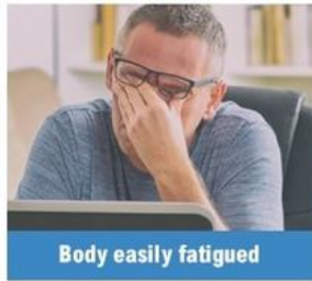
Body easily fatigued