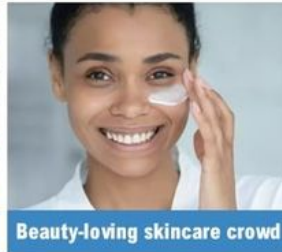
Beauty-loving skincare crowd