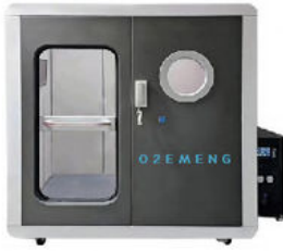
(Two people) Hard Type Hyperbaric Oxygen Chamber