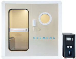
(Two people) Hard Type Hyperbaric Oxygen Chamber