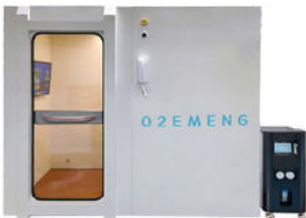
(One person) Hard Type Hyperbaric Oxygen Chamber