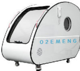
(One person) Hard Type Hyperbaric Oxygen Chamber