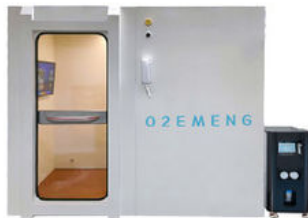
(One person) Hard Type Hyperbaric Oxygen Chamber