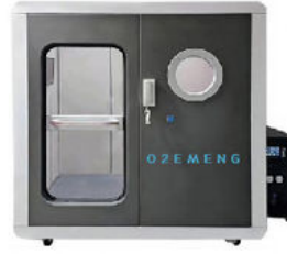
(Two people) Hard Type Hyperbaric Oxygen Chamber