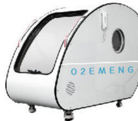
(One person) Hard Type Hyperbaric Oxygen Chamber