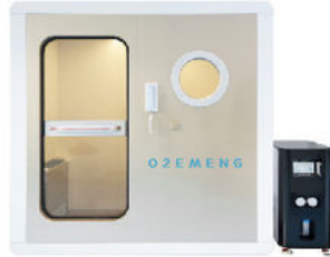
(Two people) Hard Type Hyperbaric Oxygen Chamber