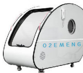
(One person) Hard Type Hyperbaric Oxygen Chamber