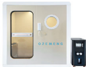
(Two people) Hard Type Hyperbaric Oxygen Chamber