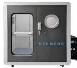
(Two people) Hard Type Hyperbaric Oxygen Chamber