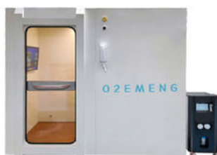
(One person) Hard Type Hyperbaric Oxygen Chamber