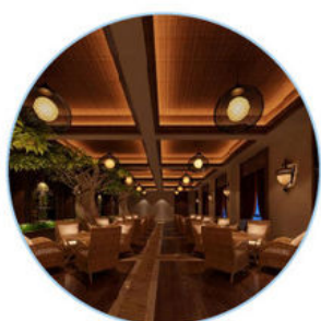
OXYGEN BAR CLUB