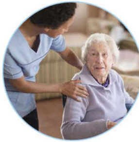
ELDERLY CARE CENTER