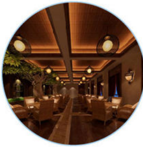
OXYGEN BAR CLUB